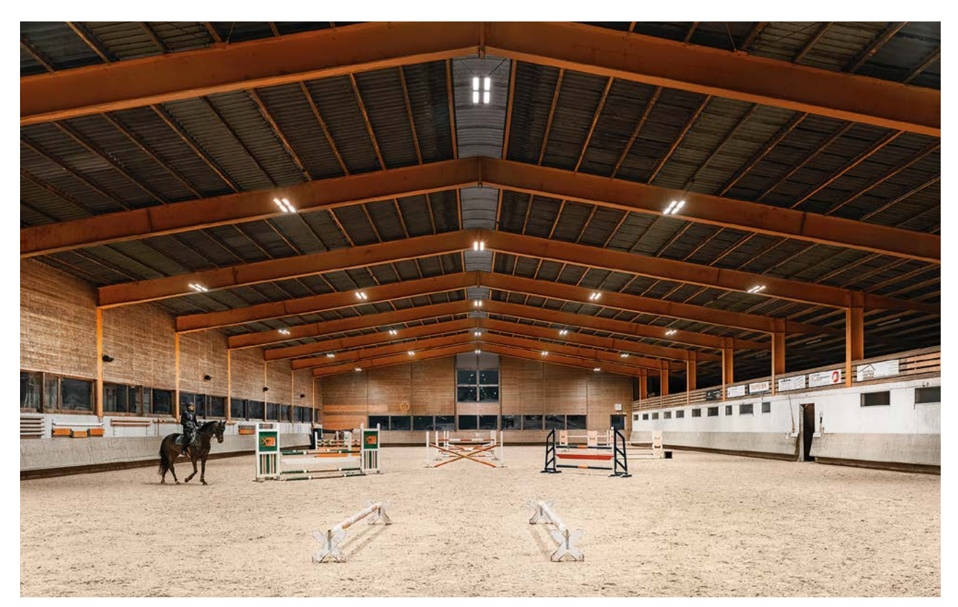
Reitsporthalle Estermann (equestrian centre), Hildisrieden | CH