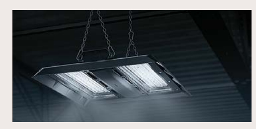
Without controlled glare optic