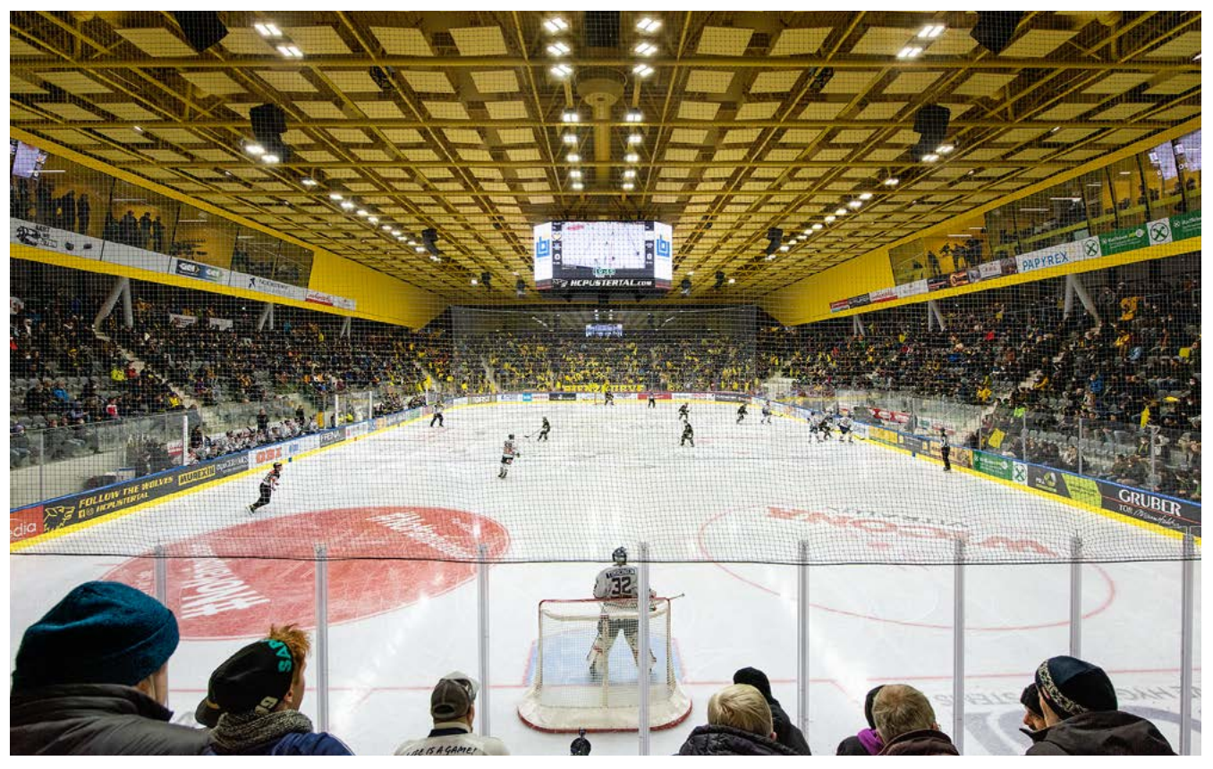
Intercable Arena, Bruneck | IT