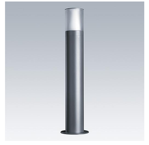
Photographs, line drawings and photometric data are representative only. For specific product detail please select an individual product.