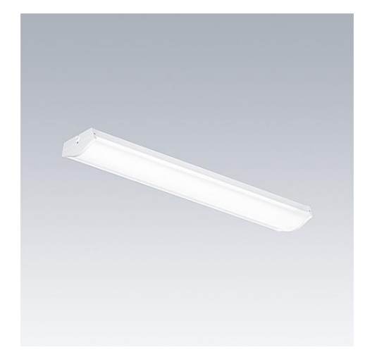
Photographs, line drawings and photometric data are representative only. For specific product detail please select an individual product.