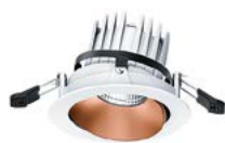
white / copper