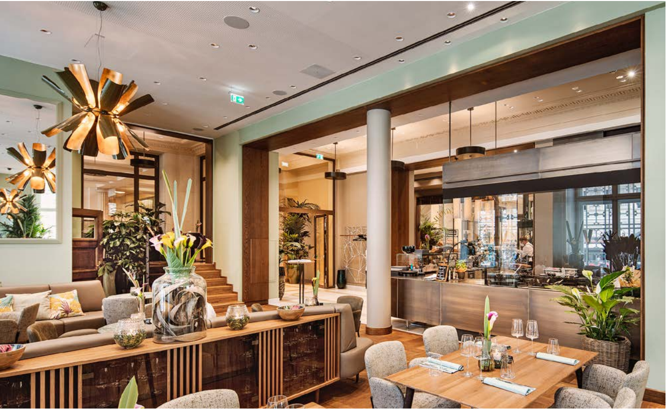
Interspar Haus am Schottentor, Vienna | AT