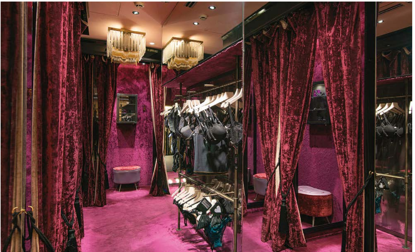
Diesel Store, Vienna | AT