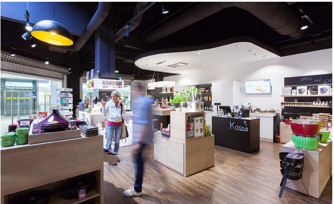
Fressbox, Graz | AT