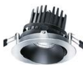
aluminium / black