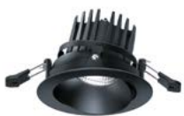
black / black

MICROS II offers various colour combinations for front ring, deco reflector and surface mounted housing: