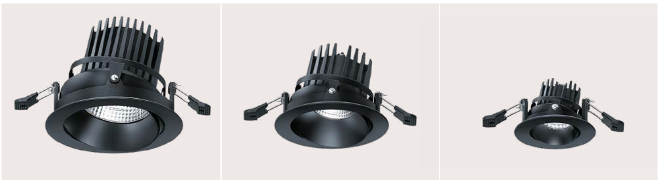
MICROS II R68