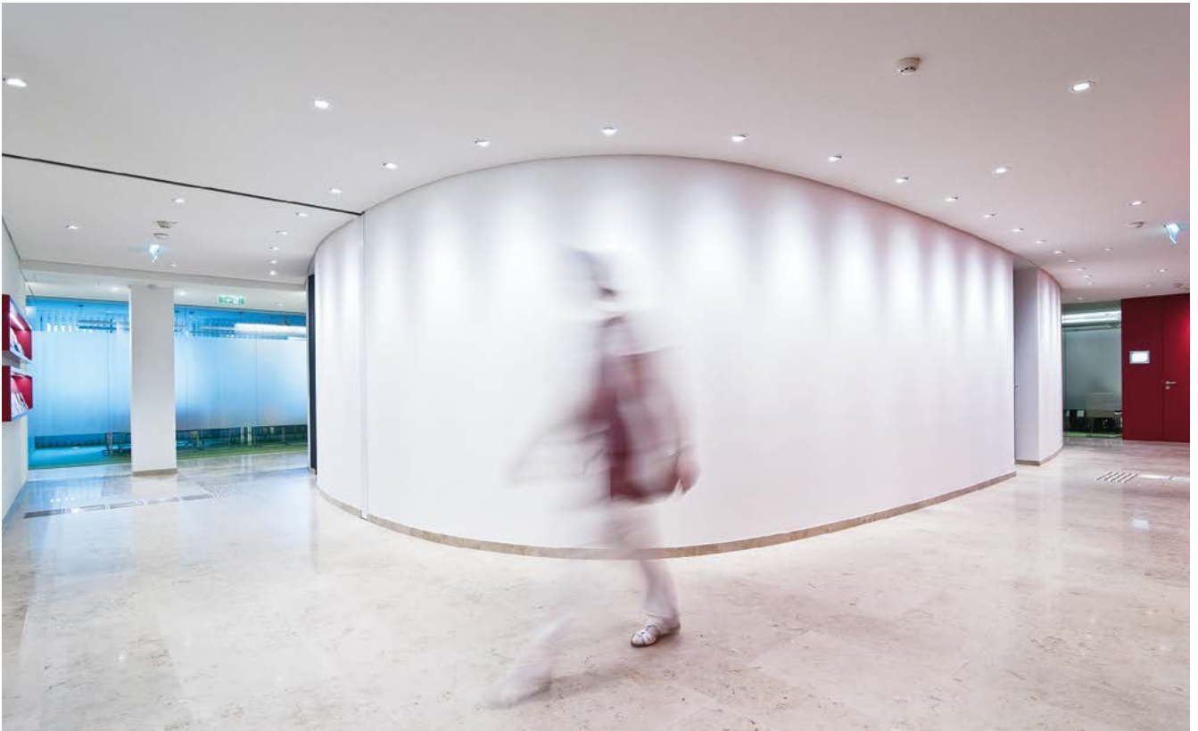
Austrian Standards Institute, Vienna | AT