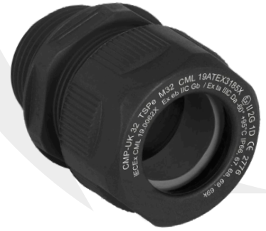
shown in black ral 9011 with standard seal